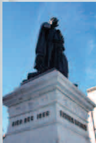
Fr Mathew Statue on St. Patrick's Street

ONLY 6% OF THE HOUSES IN CORK CITY PRE-DATE 1860.