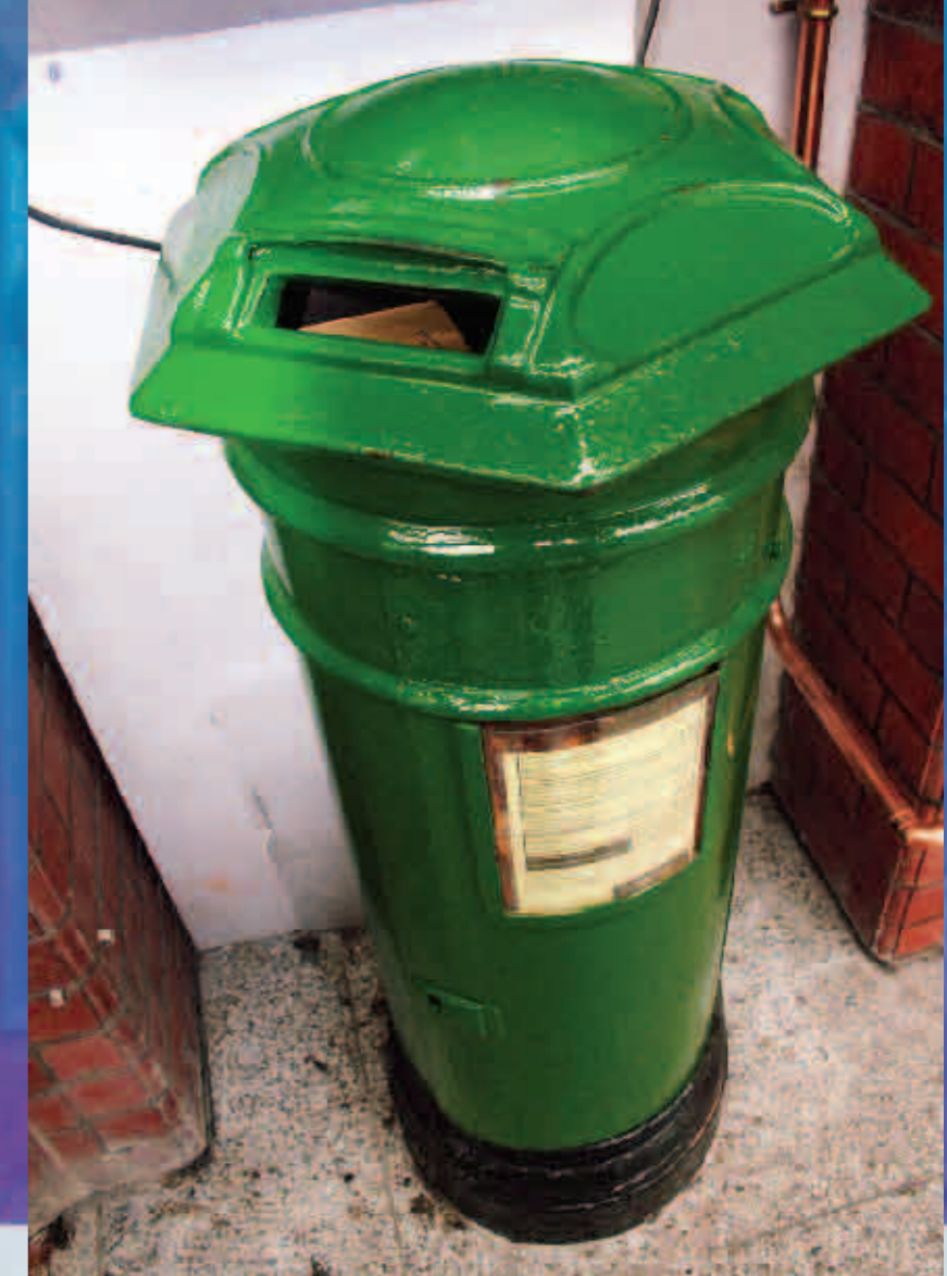
Post Box, Kent Station

CORK CITY HAS 45 HISTORIC POST-BOXES. THE EXAMPLE IN KENT RAILWAY STATION DATING FROM 1850 IS ONLY ONE OF TWO SUCH SURVIVING BOXES IN THE BRITAIN AND IRELAND. THESE WERE ALL DESIGNATED AS PROTECTED STRUCTURES IN 2007.