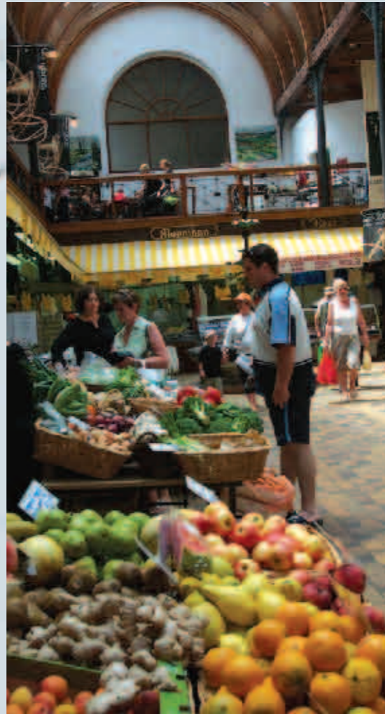
The Old English Market, Prince's St Entrance

A nineteenth century map refers to the Princes Street section of the market as the English Market, while the rest of the market is referred to as the Grand Parade Market. Nowadays the entire complex is now popularly known as the English Market.