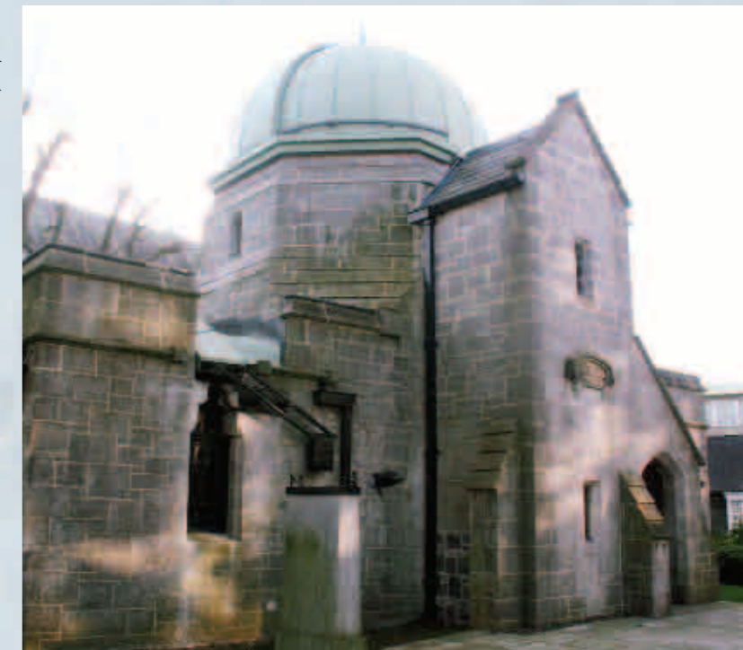
Crawford Observatory UCC

Although the educational importance of the building has declined in recent years, the department of physics has maintained a research interest there. It is currently used by students in UCC's astrophysics degree programme, and is open to members of the public.