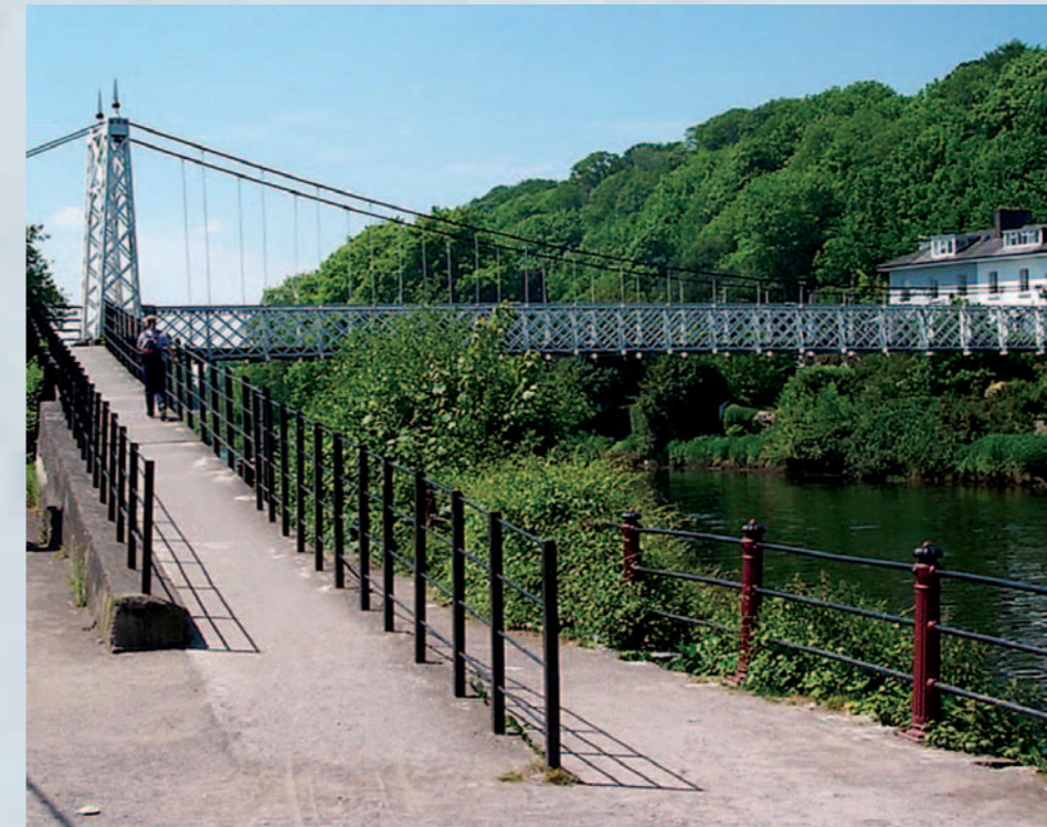
Daly's Bridge, Fitzgerald Park