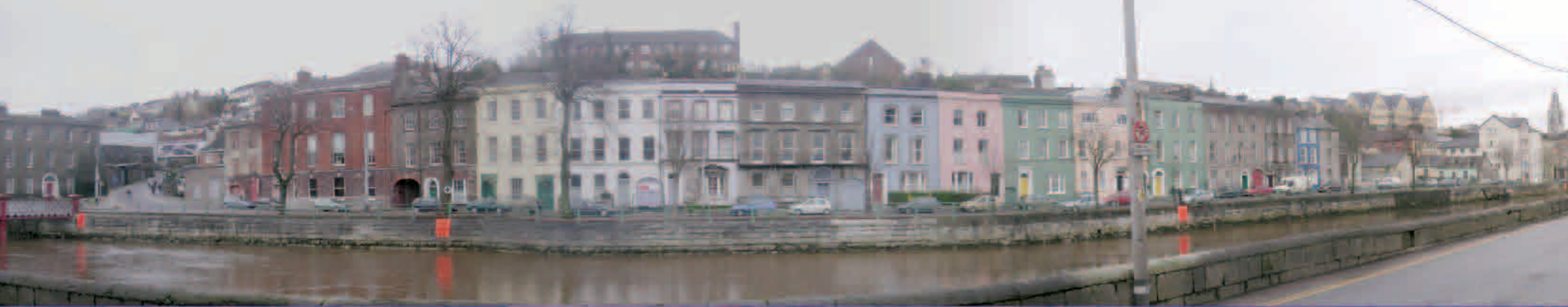
Above: Panoramic photograph of North Mall