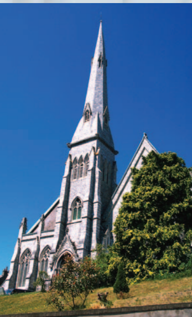
Holy Trinity Presbyterian Church Summerhill North

Yes. The Local Authority now has greater powers under the Planning and Development Act 2000 to ensure the protection of structures listed in the RPS. However, these powers are generally only used in exceptional circumstances when all other avenues have failed. A local authority may require an owner or an occupier of a protected structure to carry out works if it considers that the structure is, or may become, endangered. The local authority will specify the works it considers necessary.