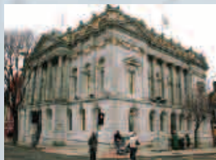
97 South Mall

What is considered to be best practice in conservation is constantly changing and being up-dated, especially in relation to techniques of repair and to design approaches to new works. What was best practice ten years ago may not be best practice anymore. Owners and occupiers and their agents should check with the various sources of information listed at the back of this publication. Cork City Council's Conservation Officer and Planners can advise on this, given adequate resources, especially in relation to the palette of forms and fabric found in Cork city.