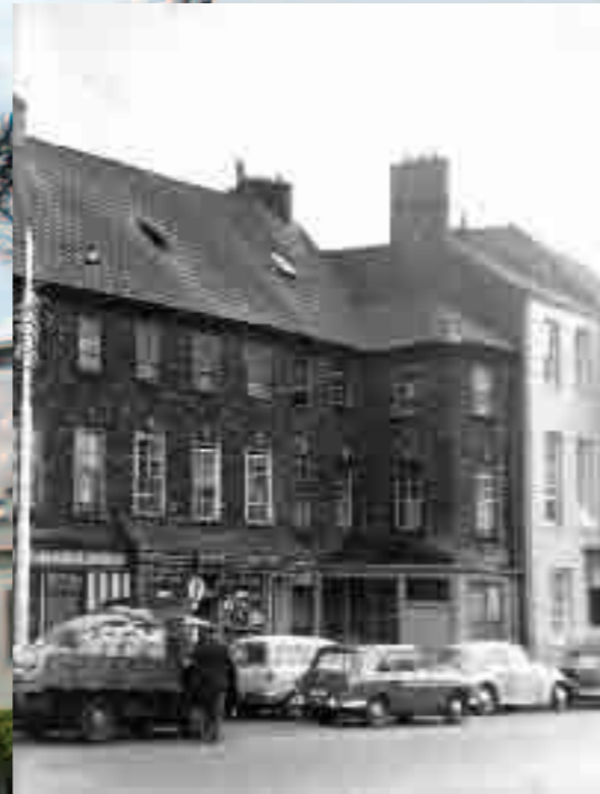
Left: Main Quadrangle UCC