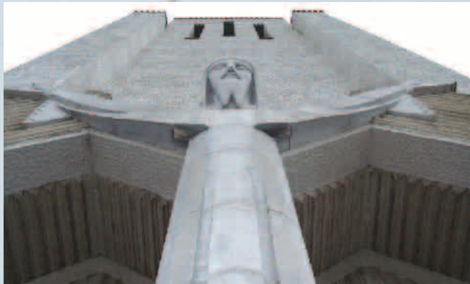
Christ King Church Turners Cross

name Christ the King Church location Turners Cross architect F. Barry Byrne (American Architect) date 1931