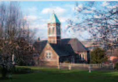
Above: South Presentation Convent Evergreen Street

Churches and Cathedrals - Often dubbed the city of steps and steeples, Cork's built heritage owes a lot to its fascinating ecclesiastical buildings which range from the magnificent St Fin Barre's cathedral to the more intimate Honan Chapel. Of particular interest are the early eighteenth-century churches e.g. St Paul's and Christchurch which were part of an extensive re-building programme after the Siege of Cork (1690), giving the city a unique legacy from this period. The internationally renowned Christ the King Church in Turners Cross is a high point of early twentieth-century architecture in Cork.