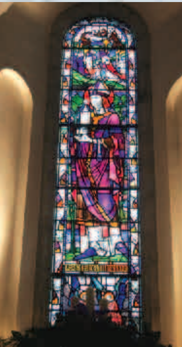
Honan Chapel interior of stained glass window

In 1897 Dan Lowrey opened the building as a luxurious new theatre called The Cork Palace of Varieties. Its origins as a beautiful Victorian theatre is reflected in the interior of the building with its impressive ornate proscenium arch and boxes and a balcony and ceiling composed of decorative plasterwork which has been restored to its former glory. During the heyday of music hall theatre 1897 – 1912 artists such as Charlie Chaplin, George Formby and Laurel and Hardy to name a few, have performed here. With the arrival of the "talkies" the Palace became a cinema in 1930 and remained so until 1988. The venue reopened as a Theatre in 1990 when it was purchased by the Everyman Theatre Company.