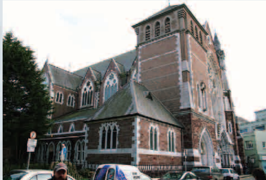
Overleaf: Former Our Lady's Hospital