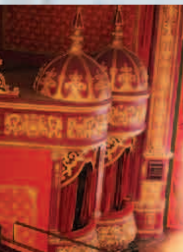
Interior Everyman Palace