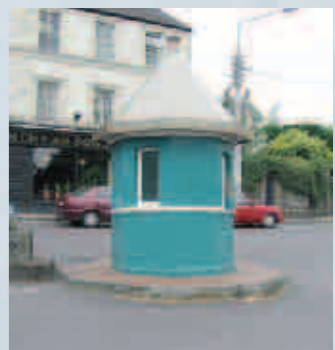
Toll booth at St Lukes Cross

This is operated by the Health Service Executive in Cork city for the over-65s for the carrying out of essential repairs in a privately-owned house. Grants are generally for the repair of windows, doors and roofs. It is means-tested. Information is available from the local public health nurse or the Health Service Executive Southern Area.