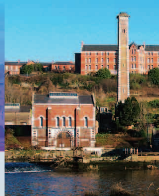
Lifetime Lab once the old Cork City Waterworks and now used as a science and educational facility.